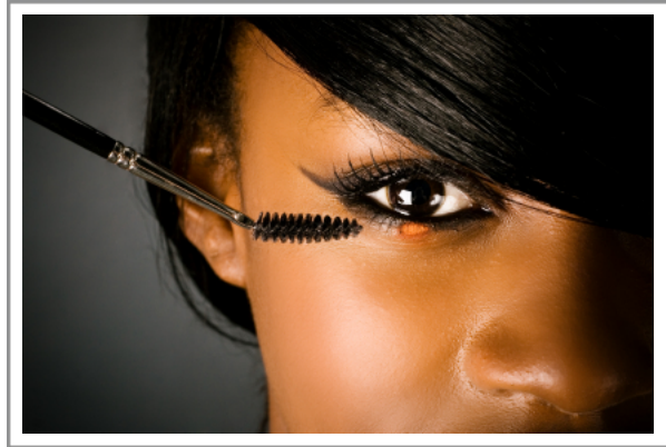
A recent study by EWG found that teenage girls' bodies are contaminated with phthalates and other chemicals commonly found in cosmetics and body care products

Cosmetic companies use more than 7,000 ingredients in their products. Despite decades of research showing that phthalate exposure is linked to many painful and devastating health effects, the U.S. Food and Drug Administration does not currently have the authority or the strength to intervene. 57